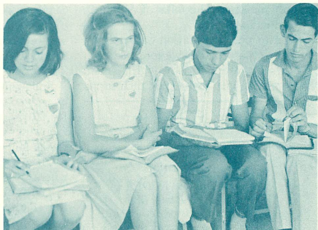
▲ YOUNG PEOPLE from Brazilian churches study the Bible during recent camp.