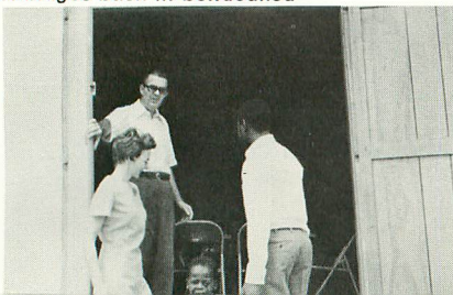
aldriged back in bondoukou