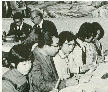
candlelight service at iriso church

A special Christmas program was held December 19 for the children, mostly elementary grades one and two. Approximately 55 attended this program.