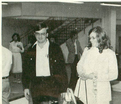
bishops arrive in japan

Romania —Harassment of Christians is being stepped up in Romania, according to a recent report in "The Church Around the World." Christians have undergone house searches, interrogations, and arrests.