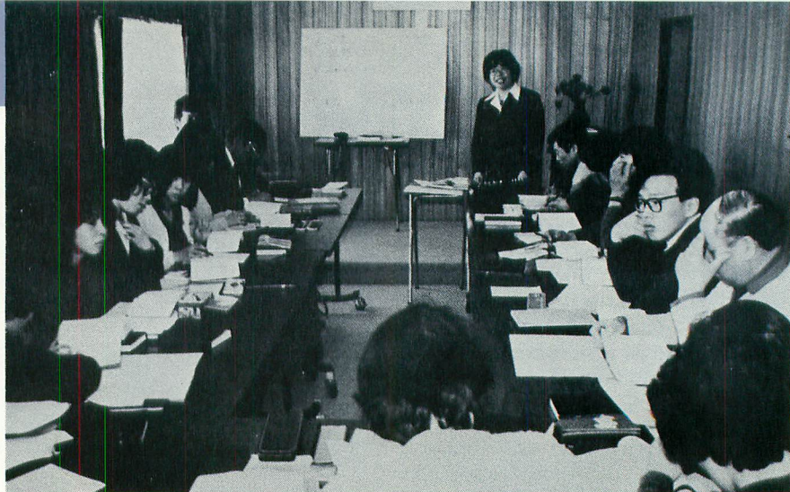
Christians from four Sapporo FWB churches and a Swedish church in the city receive teacher's training at Kita Hiroshima FWB Church in Sapporo, Japan.