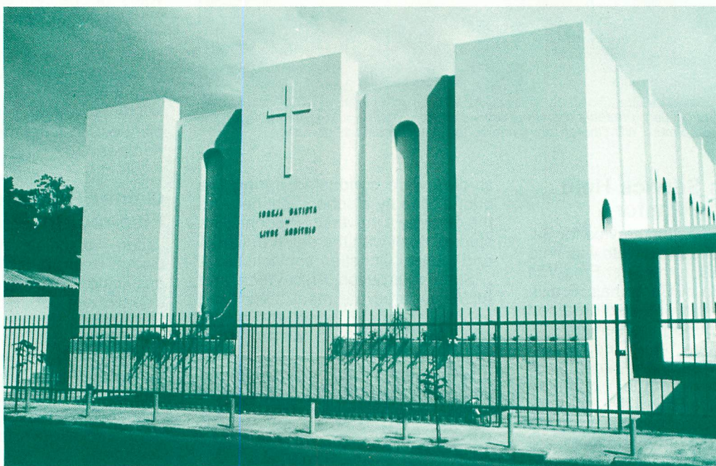
Uberlandia, Brazil, has a new FWB church auditorium.

Showing God at work through Free Will Baptists around the world