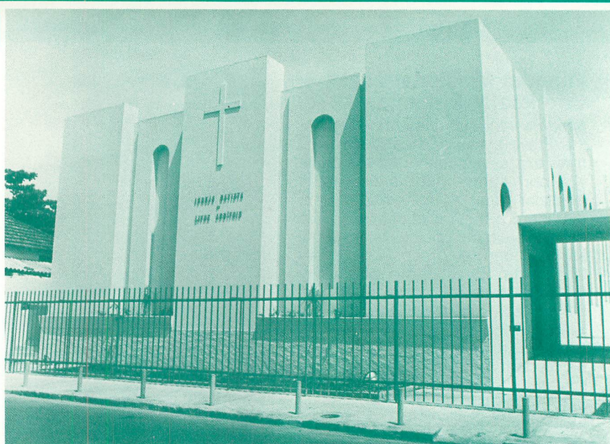
The new church auditorium at Uberlandia, Brazil, has been finished but is awaiting completion of the church furnishings so it can be dedicated and put into use.

leave for furlough this month and Mike lamented: "The hard thing about leaving is that there will be no one to care for the village work. Pray for wisdom as we try to solve this problem."