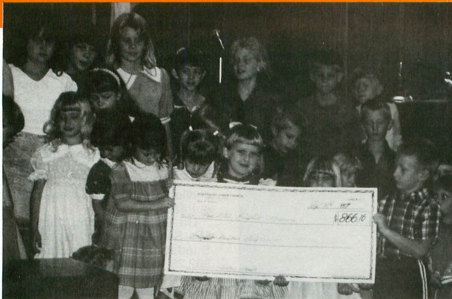
Children from the junior church of Maranatha Free Will Baptist Church in Ardmore, Okla., display an oversized check for $866.16 representing their offering of a "mile of pennies for missions."