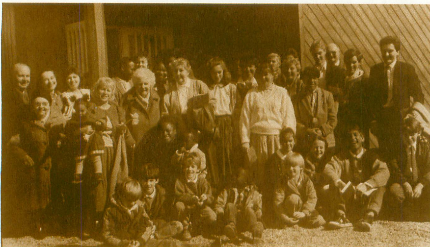
Some of the 68 people who attended Easter services at St. Nazaire, France, stand at the church entrance.