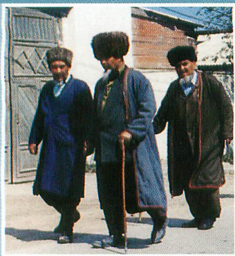
Central Asians need to hear the gospel of Christ.