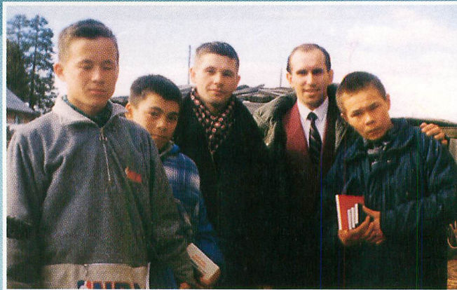
Russians took a helicopter (left) to distribute gospel literature and evangelize an unreached area of Siberia. Witnesses (above) prepare to distribute the literature in the Khanty village of Ugat.