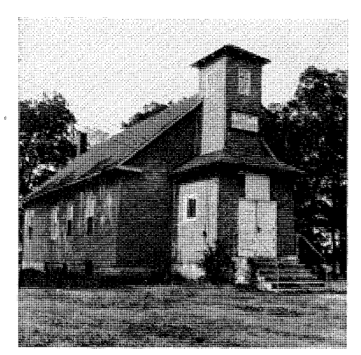
This building served the Bear Point (Illinois) congregation from 1900 until just recently.