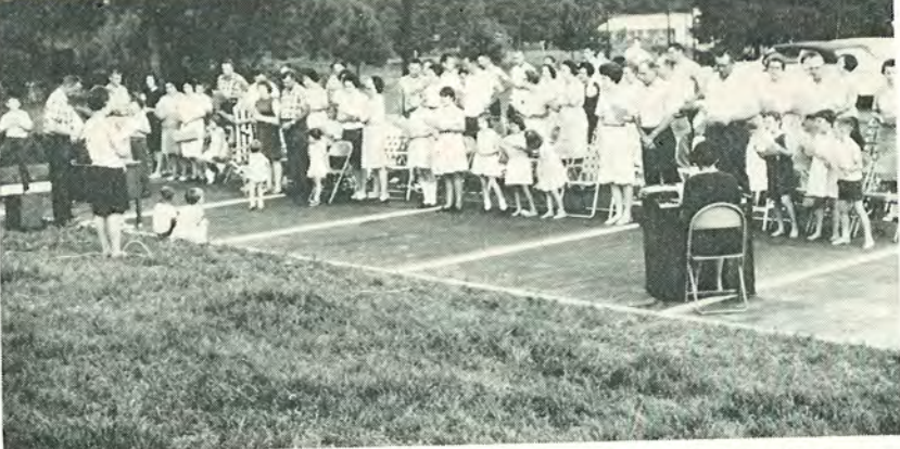
Family Night at the Raleigh Church featured singspiration on several occasions.