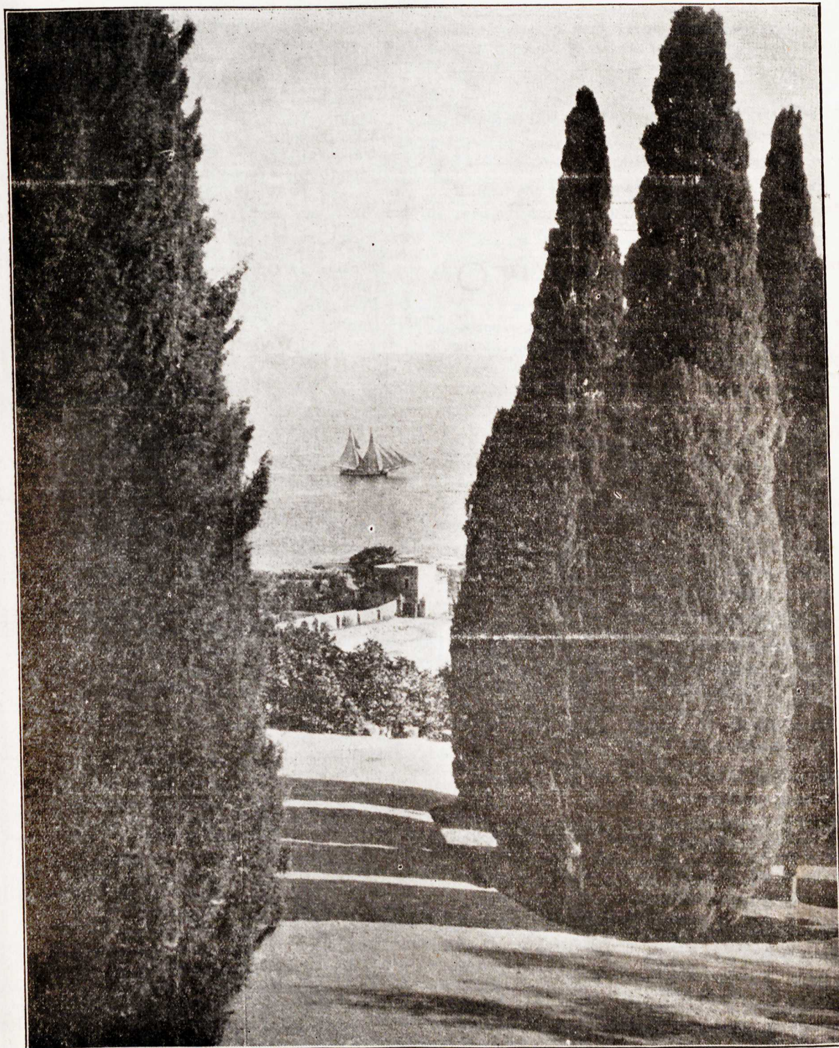
Cypress Lane, Syria