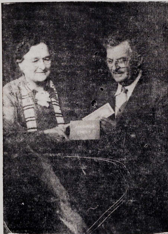
"Look papa, our mission women are using 'The Jehoiada Chests' now, for National Auxiliary work. Oh, thank you for the five dollar bill!"