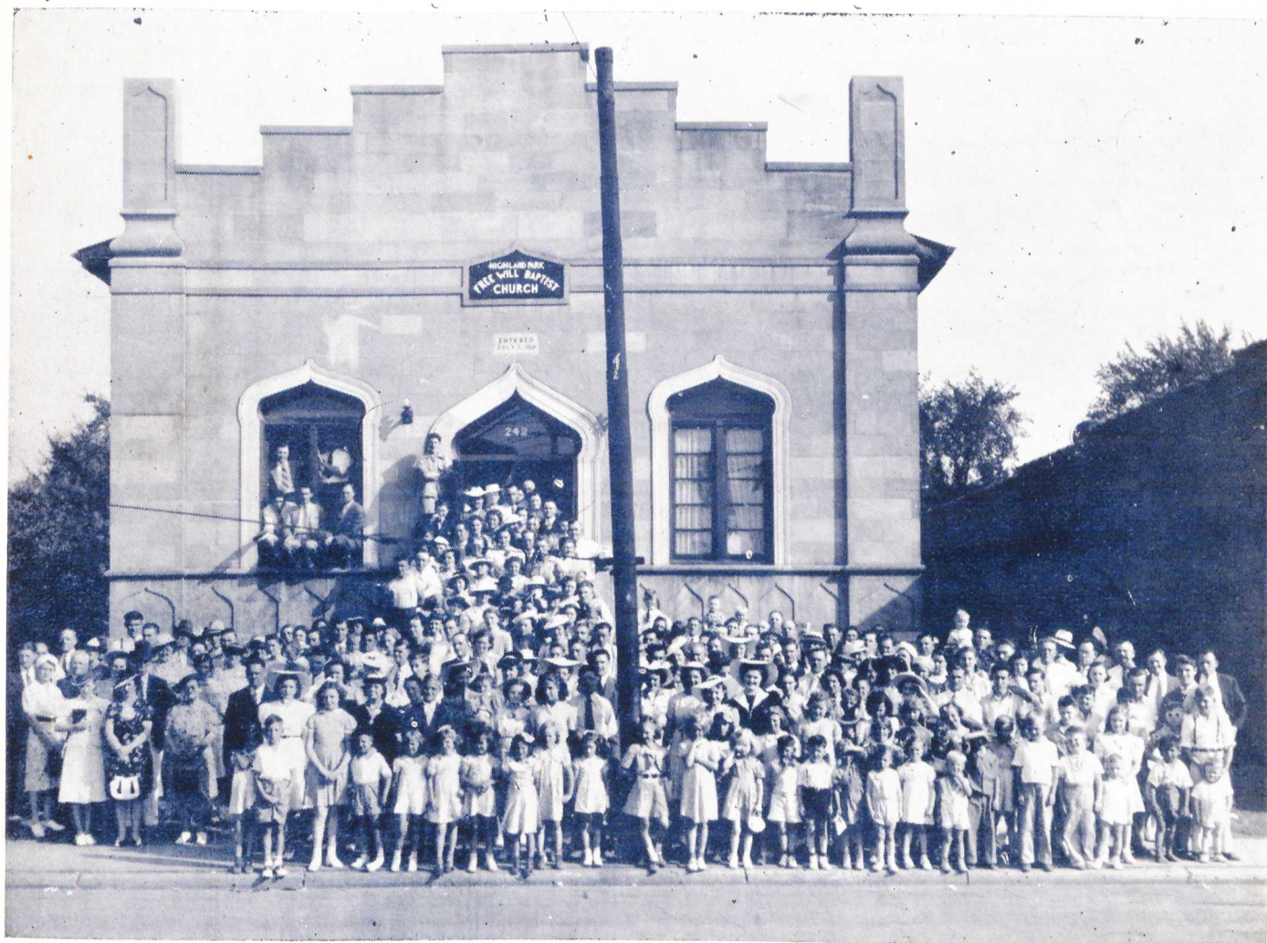
Highland Park Free Will Baptist Church Highland Park, Michigan