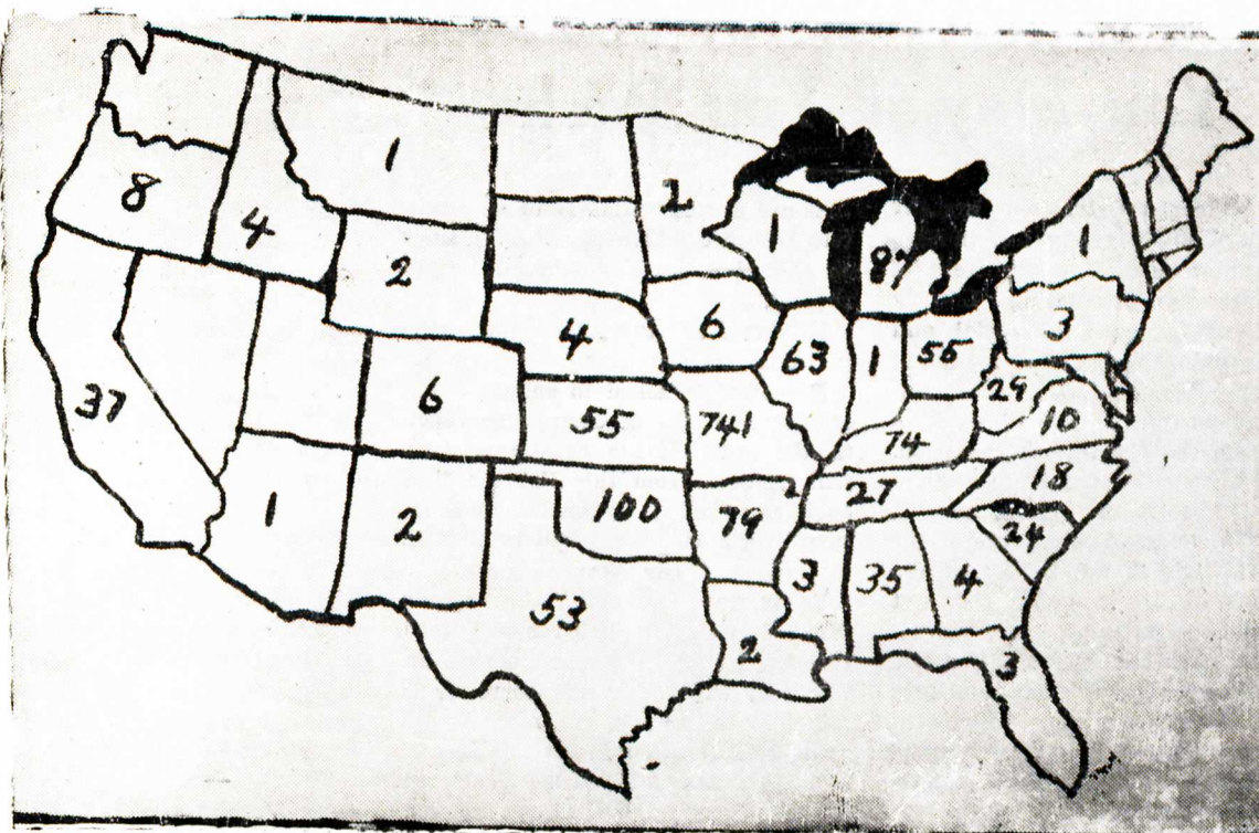
Relief Map of the United States showing the circulation of the Gem