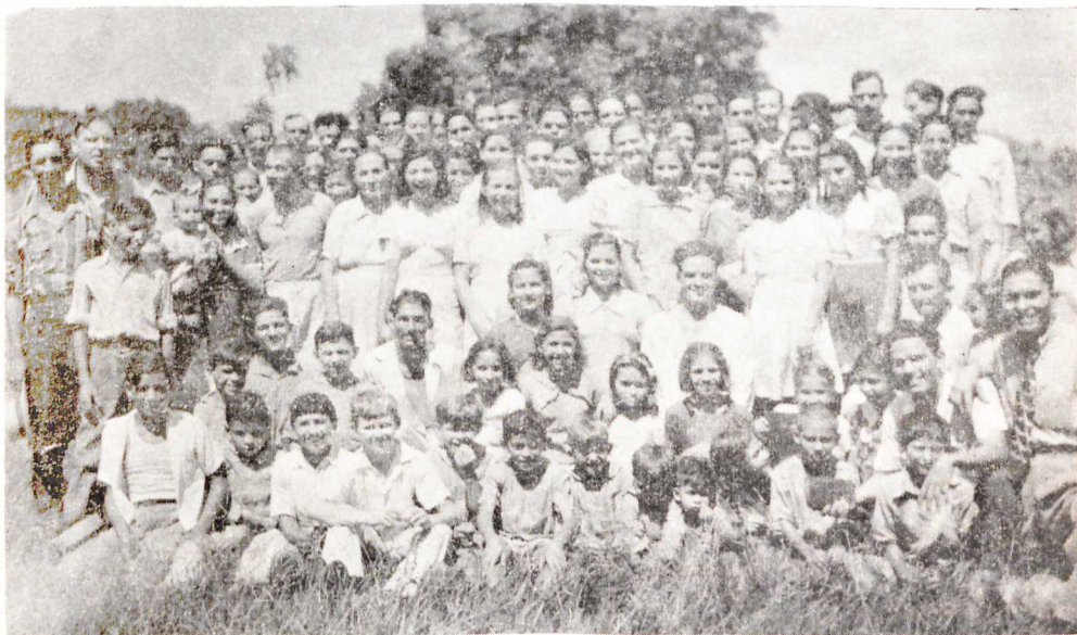
This large group is the membership of the Free Will Baptist Church at Sabalo.