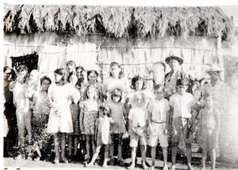
The Free Will Baptist Church, San Andres