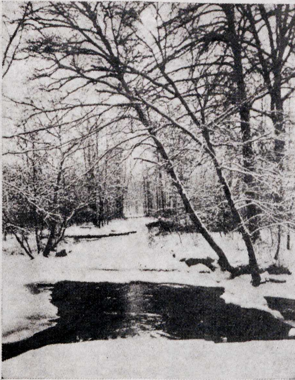
“A Scene in Winter”

“Seems to me the stars shine brighter, Seems to me the snow lies whiter, That the solemn trees stand straighter, And the frosty moon sets later, And the hush is stiller, greater, Since Jesus controls my life!”