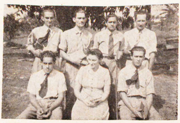
The Student Body

liberality of their hearts, sent us blankets without which these Free Will Baptist young people of Cuba would have suffered intensely during this cold winter. You say cold in Cuba? Yes and plenty, a damp penetrating cold similar to that of Florida. Their part in exchange for food and training is to work four hours each day on the farm, careing for the stock, clearing off the farm, cultivating the orange trees, building necessary houses and barns, and planting. Again we wish to tell you that since September when we bought the farm, continued improvement has been made. The farm consists of about eighteen acres six miles from the heart of the capital of the Province of Pinar Del Rio, the center of our missionary activity, transportation is very good by