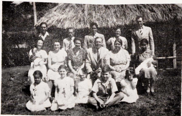
Our Staff of Workers both American and Foreign

There was a large crowd present the day of this convention. Some were there from as far as forty miles. We noticed some of them coming in groups with song books in their hands singing as they gathered. Our people throughout the work are a great people to sing. The climax of the