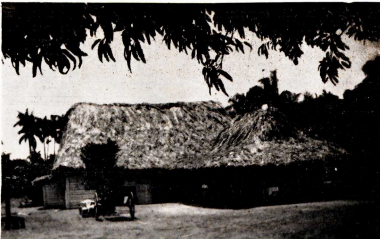
Our Cuban School of Missions