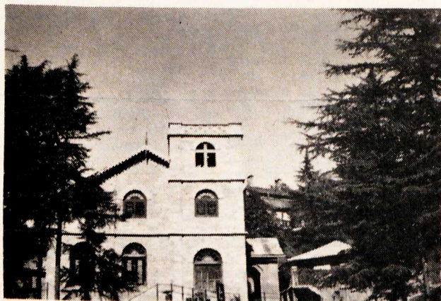
Kellog Memorial Church

Where The Landour Language School Is Held