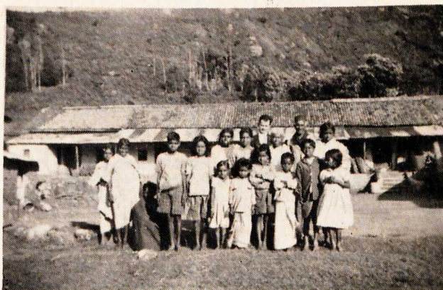
An Early Congregation a Little After "Sun-up"

the Orient. However, I can truthfully say that one will see more physical deformity here in a day than he would in the southern states of the United States in a year. An immeasurably large percent of the people are suffering from physical ailments. These ailments range from all manner of skin diseases—some are covered from head to foot with plain itch, raw sores and swollen limbs—to various blood diseases including the venereal diseases, malnutrition, worms and many other terrible diseases. Of course, some of these ills are not as prevalent among the better classes. However, due to the climate, general sanitary conditions, lack of necessary miner-