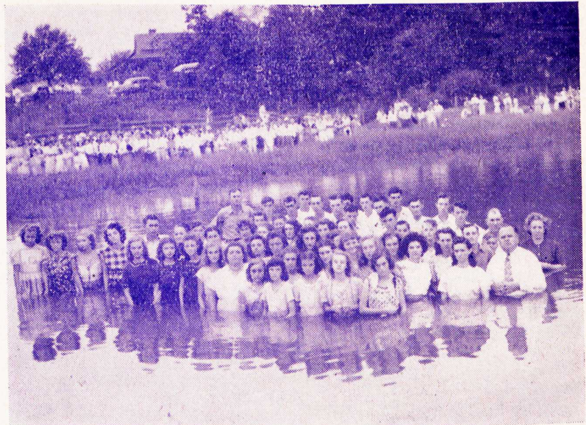
A Baptising Scene Near Halcut, Miss.

9:30 a.m. in assembly meeting singing our Theme Song, Heavenly Sunlight.