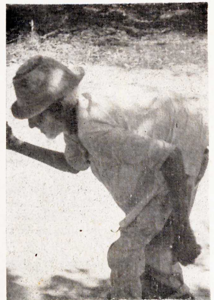
Walking About at 118 Years

In every field we have faithful laymen who are seeking the salvation of those about them. It was through the