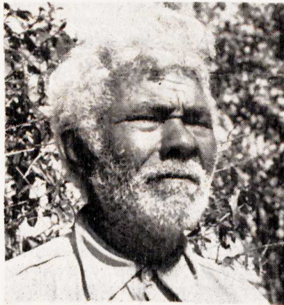
The Son—In His Seventies