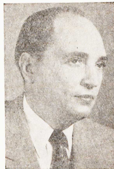
Dr. Bob Jones, Jr.

Because of the many forces being brought to bear against the American home, the program committee felt that a service emphasizing the need of revival in the Christian home during this year's association would meet a real need. So the entire worship service on Wednesday morning, July 14, will be developed around the keynote, "Revival in the Christian Home."