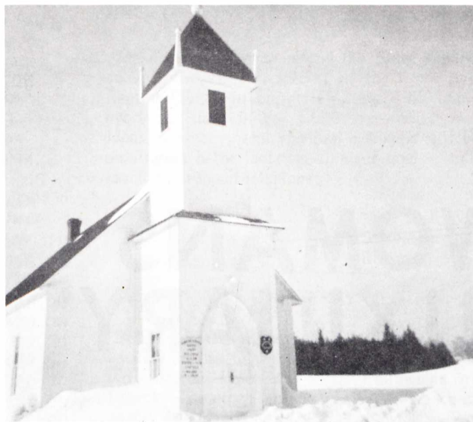
HAWKINS CORNER CHURCH New Brunswick, Canada

On February 7, 1964, we had our first graduation of the Bible Institute. We had five boys and 2 girls to graduate. This was truly a happy time for us. As we