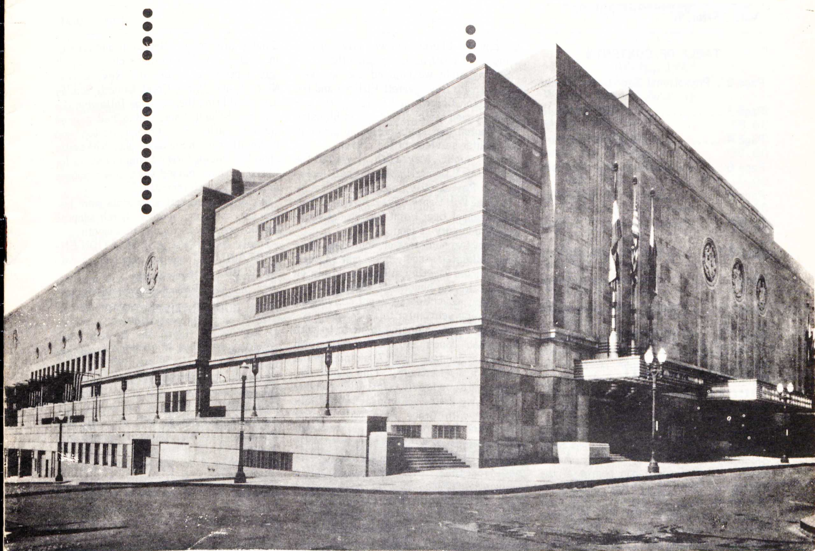
Site of 28th Annual Session of the National Association of Free Will Paptists, July 14-16, 1964, Kansas City, Missouri