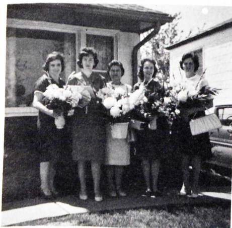
Taken before our visit to the Penns Nursing Home.