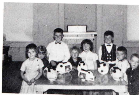
Children from the Conway F. W. B. Church Conway, Missouri