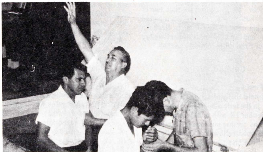
One of the deacons is with me in the baptism.