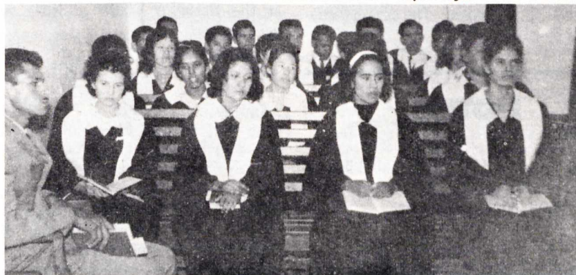
This is the Sunday morning choir. We have another choir, "The Good News Choir", Sunday evening.