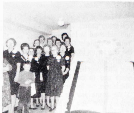
The beautiful decorations of the church were equally balanced with the warm fellowship of the host auxiliary of the Monett Church.