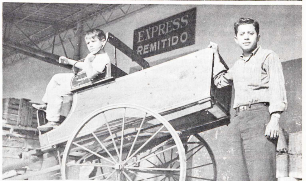
Buggy for Old Mexico.