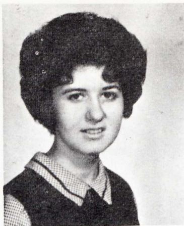
Deanne Wantland Grant Avenue Free Will Baptist Church Springfield