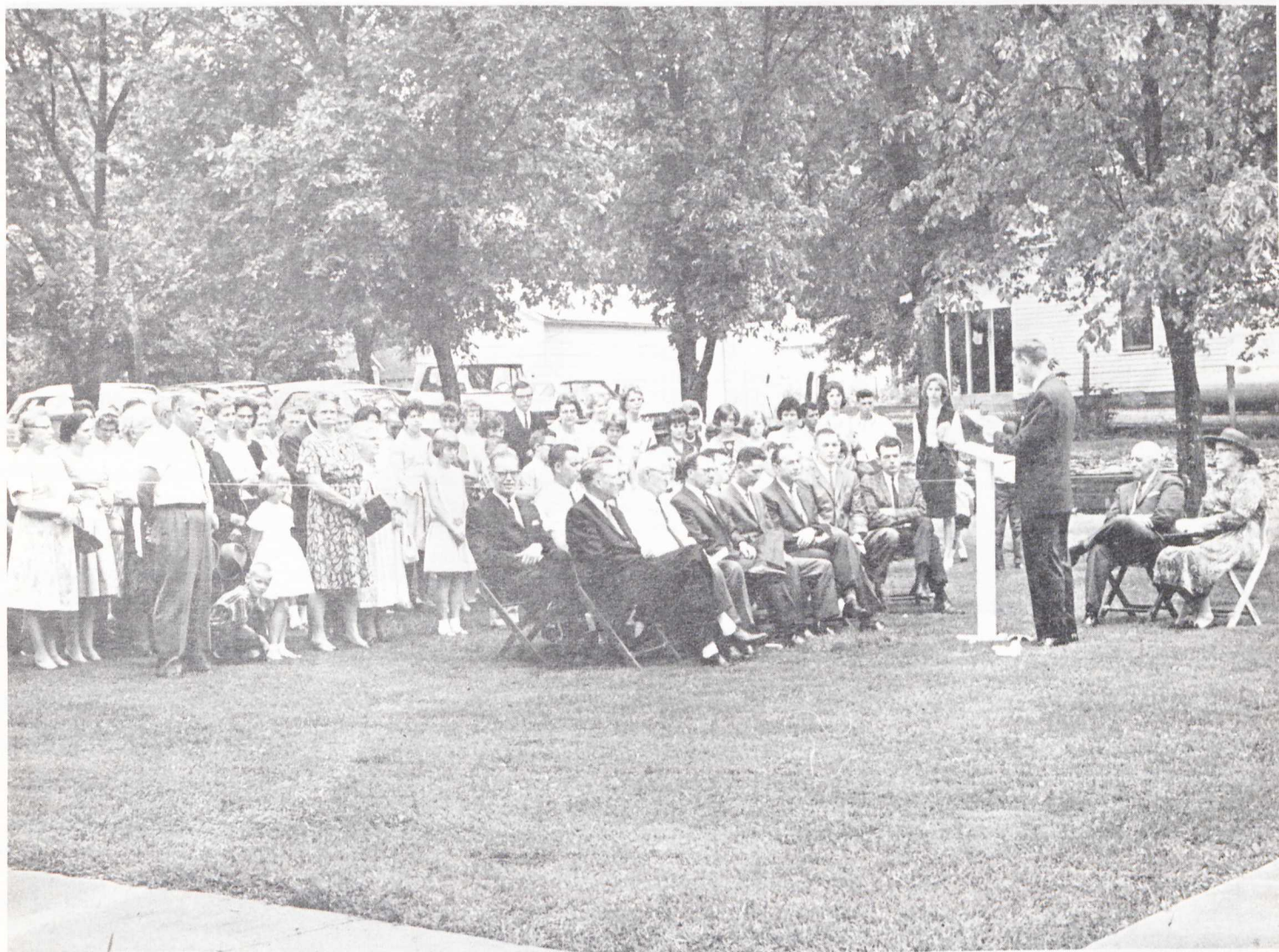
GROUND BREAKING SERVICE AT FIRST FREE WILL BAPTIST CHURCH, LEBANON, MISSOURI