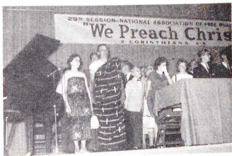
Part of the group of approximately 35 missionaries that attended the National Association.

One important and imperative item yet remains. We still must raise $20,000 to purchase the additional two acres of land which we have under option. This option will expire on September 24, 1966. You will be hearing more about this in the months ahead and I trust that