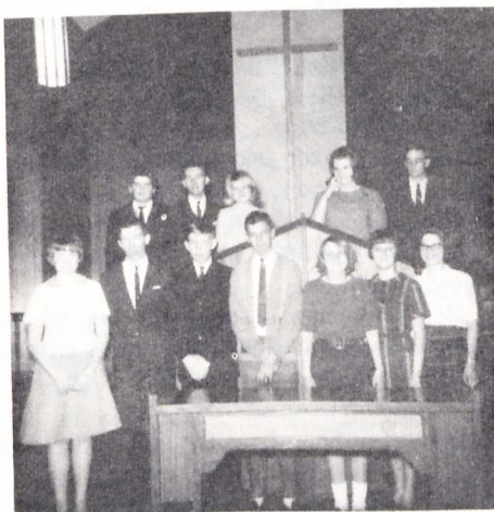
The four competing Bible Bowl teams were left to right back row: Lebanon team and Willow Springs team. Front row: Rock Chapel team and Pleasant Home team.