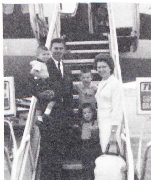
The Fulcher family leaving from Lambert airport going back to their mission field in Uruguay.