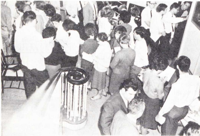
Second Semester Student Registration