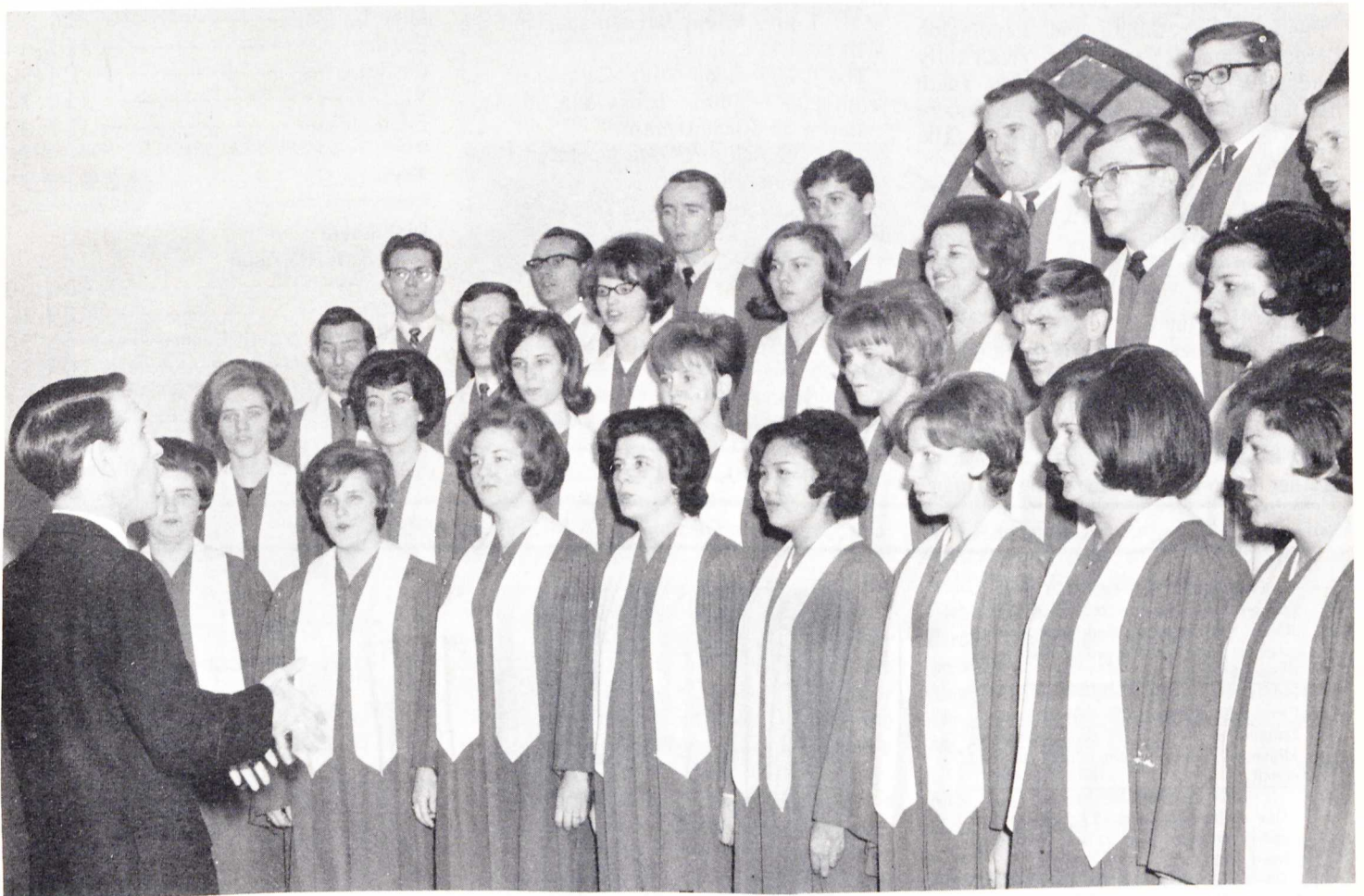
1966-67 BIBLE COLLEGE CHOIR (Page 6)