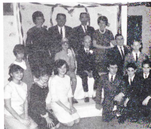
The picture above was taken at the Herald's for Christ Valentine Party at the Berkeley Church. Included in the picture Free Will Baptist Gem