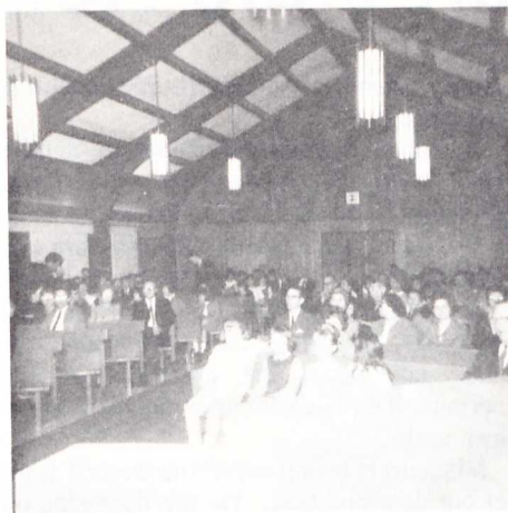
A view of the congregation as they were gathering before the services began also affords an excellent view of the beautiful Lebanon Church which is just only slightly older than our C.T.S. Rally.