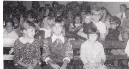
St. Joseph Church