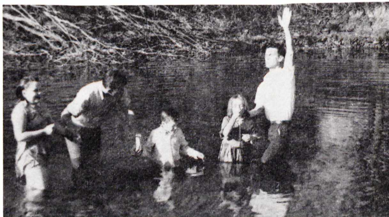
BAPTIZING SEPT. 28, 1969

Now I must say something about faithfulness. We have been particularly blessed with a devoted Sunday School staff, from the Superintendent through the teachers and assistants. This faithfulness is demonstrated at each appointed meeting time with little or no absences. Our Sunday School has consistently received the attendance banner for most present in our St. Francis County Sunday School Convention. This convention is held the first Sunday afternoon of every quarter. The banner is awarded on the basis of average Sunday School attendance, but it is not unusual for this church to have the greatest total number present. In our most recent meeting, Sunday October 5th, we were represented with a total of fifty-three present, a greater number than any other church in the convention. Now this may seem to some a small thing, and it may be, but to me this is faithfulness. Jesus said, " He that is faithful in that which is least is faithful also in much. " (Luke 16:10a). To me, church attendance is the least thing we can do, but our faithfulness must begin here. I doubt that people are faithful at all who are not first faithful in assembling themselves together. One of the blessings of