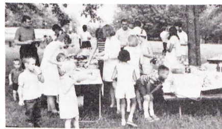
Columbia Church fellowship

The church has a heavy financial responsibility for their land and the missionary pastor's salary has begun the gradual phasing out as scheduled with the State Mission Board.