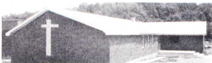
WAYNESVILLE IN NEW BUILDING

The Happy Hill Church of near Lebanon, has begun their building program for new Sunday school rooms. Pastor Joe Fulkerson stated the rooms were needed for the instruction of their students and also the church has started sponsoring some foreign missionaries.