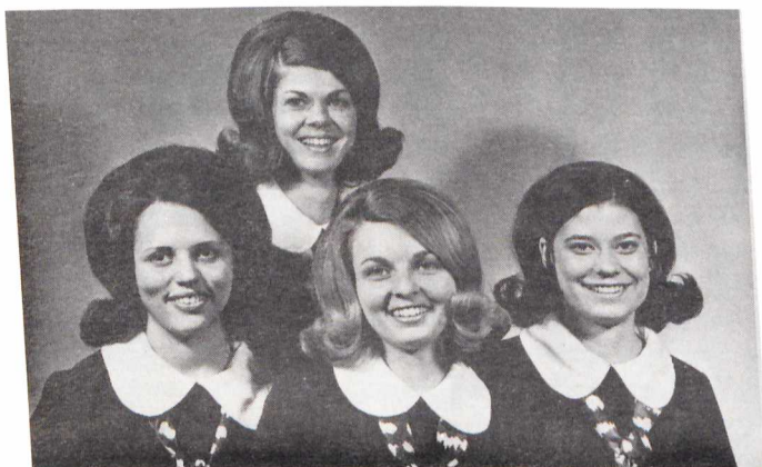
THE GLEANERS TRIO