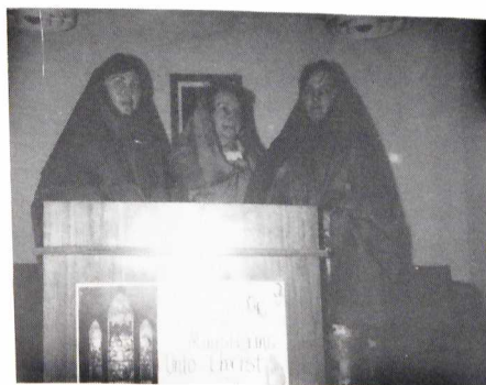
"Women Ministering Unto Christ" was presented as the program for the Viburnum Auxiliary

The Berkley Auxiliary met May 5 with opening prayer. The business of the meeting followed regular order with the names of new officers being submitted and elected. A standing vote of thanks was given the officers of the past year in appreciation of their labor of love. A thank you letter was read thanking the auxiliary for a missionary's Christmas gift.