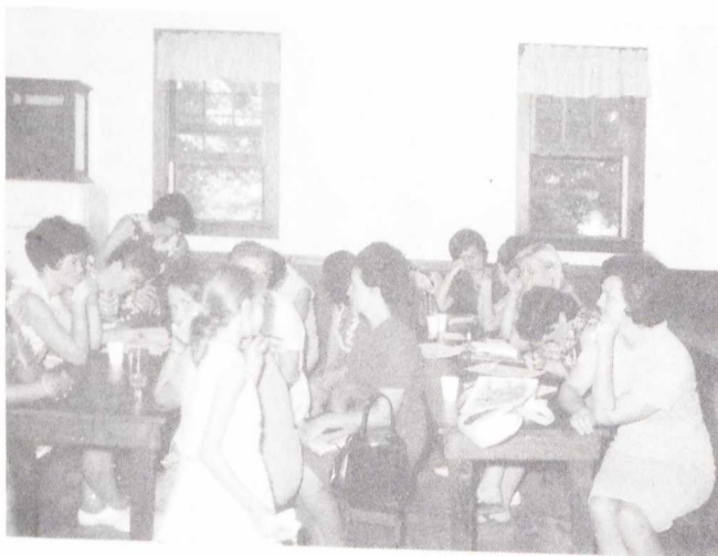
The thankless task of grading tests is a part of teaching. It really doesn't look like a happy time, does it?