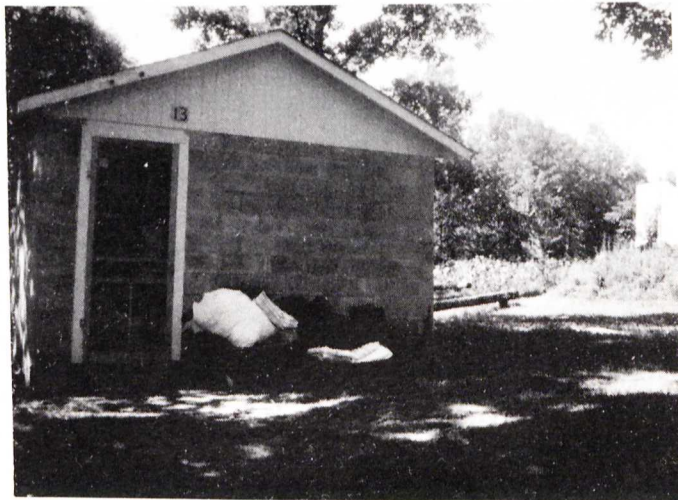
Even the best of times must come to an end. This is evidenced at Youth Camp by the pile of bedding and other belongings awaiting the arrival of a bus or truck to haul them back home.