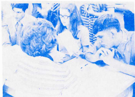
Teachers assisted the 186 new students who enrolled for classes at the Bible College this fall.