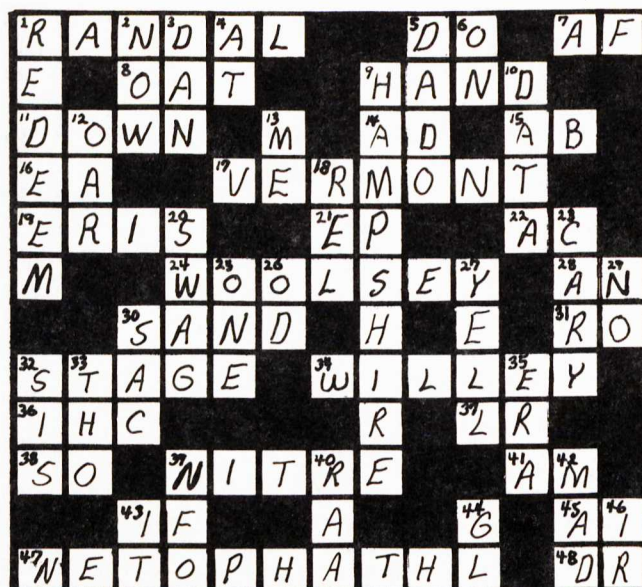
ANSWERS TO PUZZLE No. 1