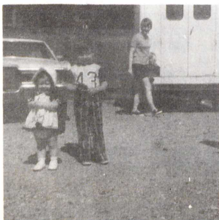
Participants of Cuba, Missouri, FWB Church walk-a-thon.