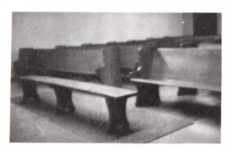
Many Blessings at Malden

A final note of interest concerning the young people is a Rock-O-Thon (this consists of rocking in a rocking chair for hours and hours) that was held with the proceeds being used to help with the expense of the parking lot.