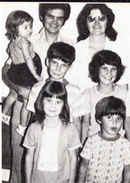
The Norris family