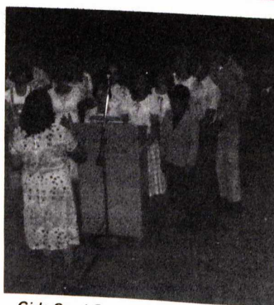
Girls Coral Group, Fellowship Church