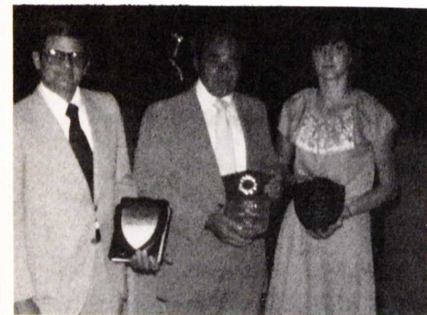
Home Missions Awards