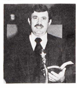
Wednesday, June 6, 1979