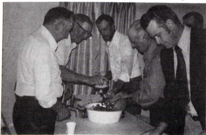
Breaking the love loaves at Hannon.