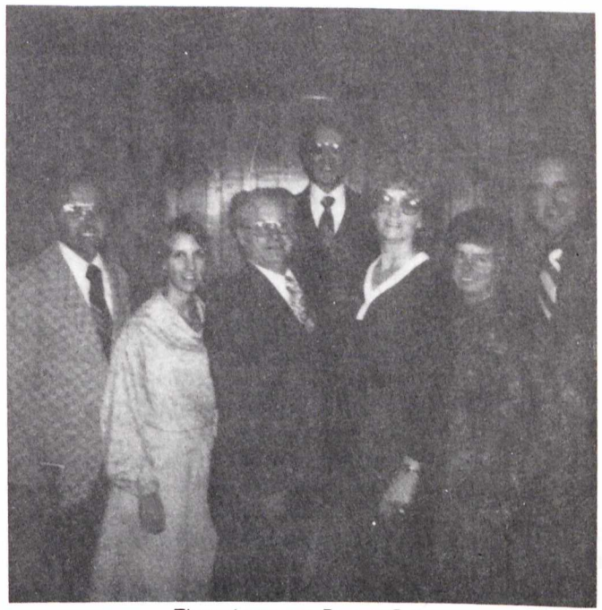
Three deacons at Eastern Gate

"The Lord is blessing the work at Eastern Gate, and the Holy Ghost is revealing the love of Jesus Christ in every service. We ask that our brothers and sisters remember us in prayer as we continue to serve Christ."