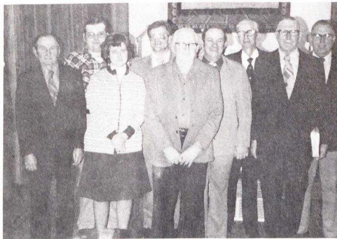
Officers and pastors of Niangua Quarterly Meeting