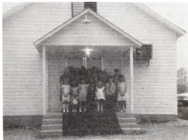
(Pleasant Ridge Youth Group)