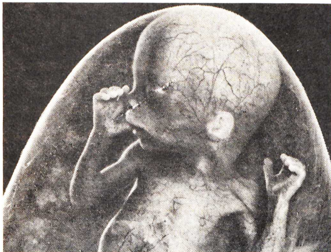
Unborn child 18 weeks after conception, "Life Before Birth," Life Magazine, 1965.