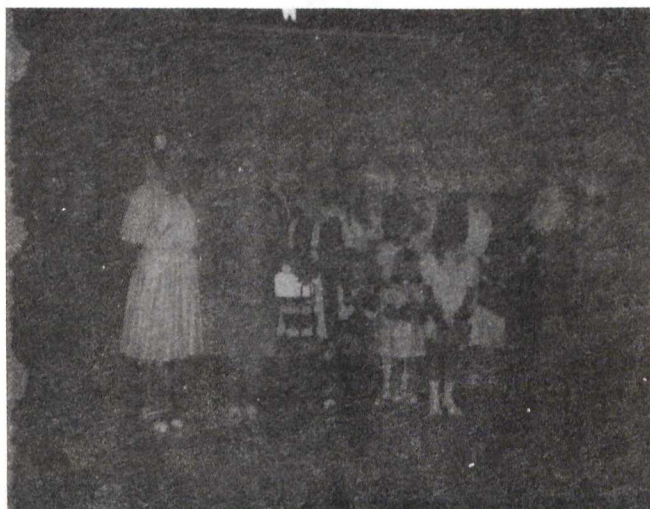
"Fanfare To Mothers And Daughters"