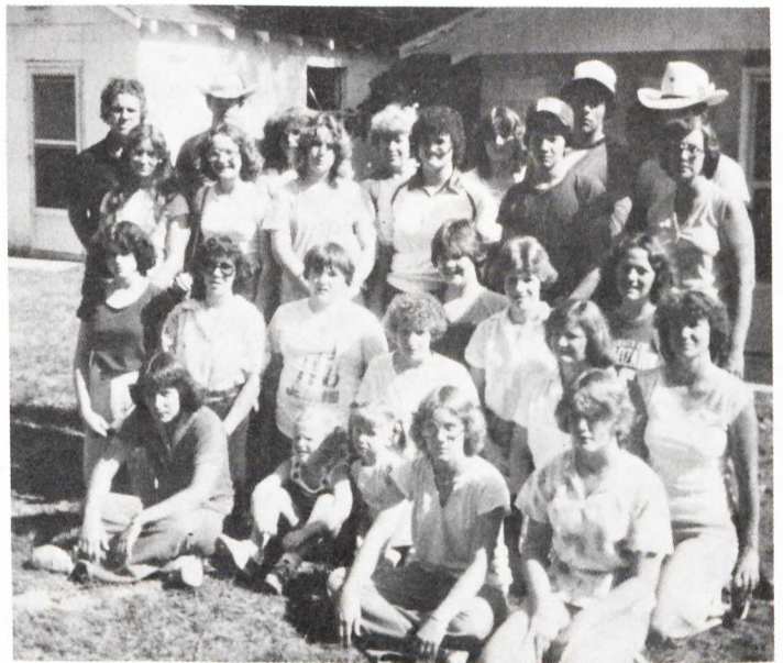
Cave Springs group