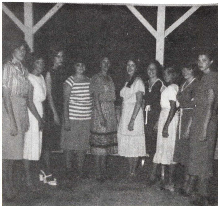
Missouri State C.T.S. Winners; Chorale From Grant Avenue, Springfield, MO