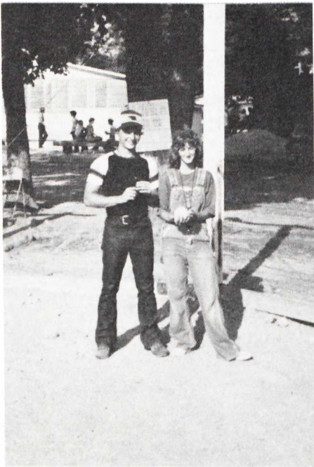
A Happy Couple