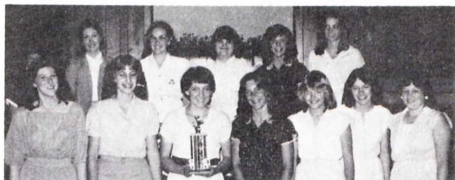
Chorale Grant Avenue Girls Chorale