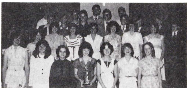
Choir Heralds and Crusaders *Farmington Teen Choir