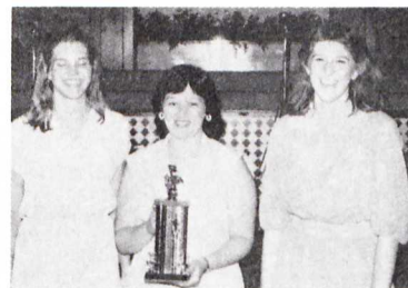
Trio Grant Avenue Girls