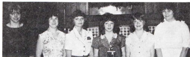
Sextet Farmington Teen Sextet