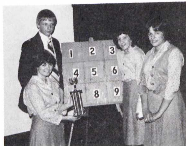
Willow Springs Team 3rd place

All music, Oral Communication and Art received number one ratings. The ones with * received highest number one ratings.