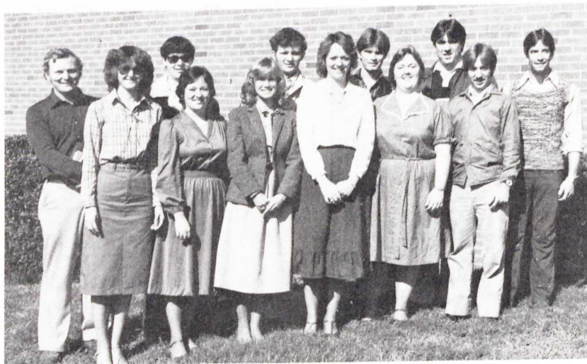
Missouri Students attending Hillsdale Free Will Baptist College