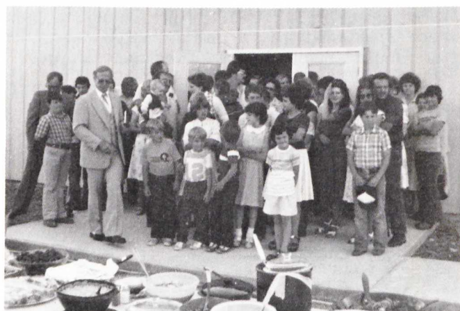
Calvary Chapel congregation