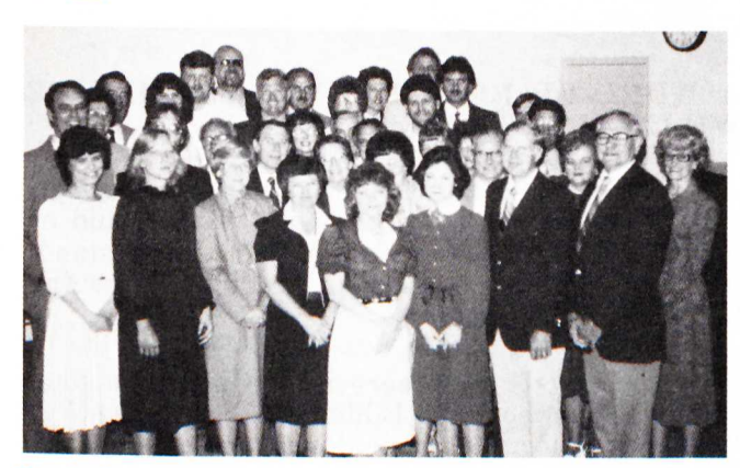
Christian Workers Appreciation Banquet-Trinity